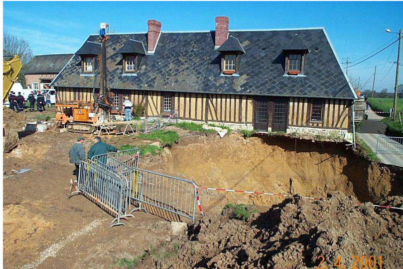
Figure 3. Sinkhole in a French urban area.

For the first one (e.g. longwalls), surface instability is often limited to continuous subsidence (able to damage buildings and infrastructure) that take place mainly during mining activity and reaches a stable state quite rapidly. For operations leading to large persistent residual voids (e.g. rooms and abandoned pillars), the mine workings stability may be affected by a bad design and the “rock weathering effect”. Apart from subsidence possibility, this type of operation may also be the source of discontinuous subsidence (e.g. sinkholes, massive collapses) that may develop long time after closure. This is why those potentially dangerous events (figure 2) are very difficult to predict (Didier and Josien, 2003).