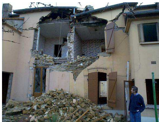
Figure 1 : Damages generated by Auboué subsidence

About 70 buildings had to be demolished and 150 families, victims of damage, had to be relocated (figure 1). In the following months, other instabilities developed in the nearby cities of Moutiers (90 other families moved in may 1997), Moyeuivre, Roncourt, etc. Other types of disorders also developed at the same period: flood of basements, oxygen-deficient air in cellars connected to the mining galleries due to mine gas accumulation, etc.