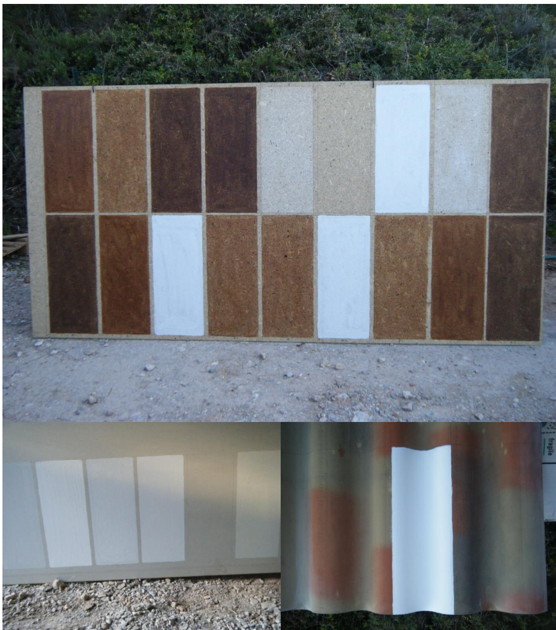
Figure 1 : Paints and varnished with ENPs additives, and paints containing ENPs on wood panel, plaster with cardboard, and cement plate