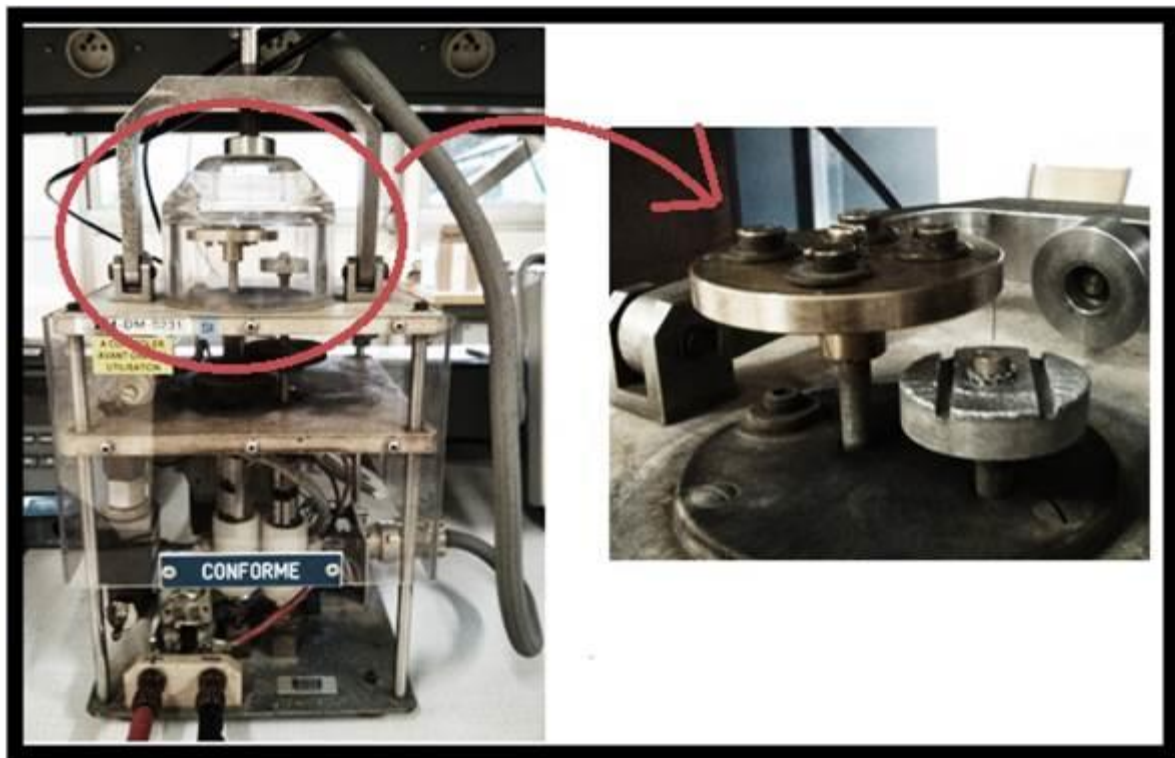
Figure 1: View of the spark test apparatus.

A homogeneous mixture at the selected methane/hydrogen blend concentration in the explosive methane/hydrogen blend - air test mixture is obtained by applying a 3 min purge time before starting a test, which corresponds to about 20 times the volume of the gas chamber. An orifice on the explosion chamber is used to circulate the gas mixture, avoiding the pressure increase into the gas chamber during the test mixture feeding before the ignition.